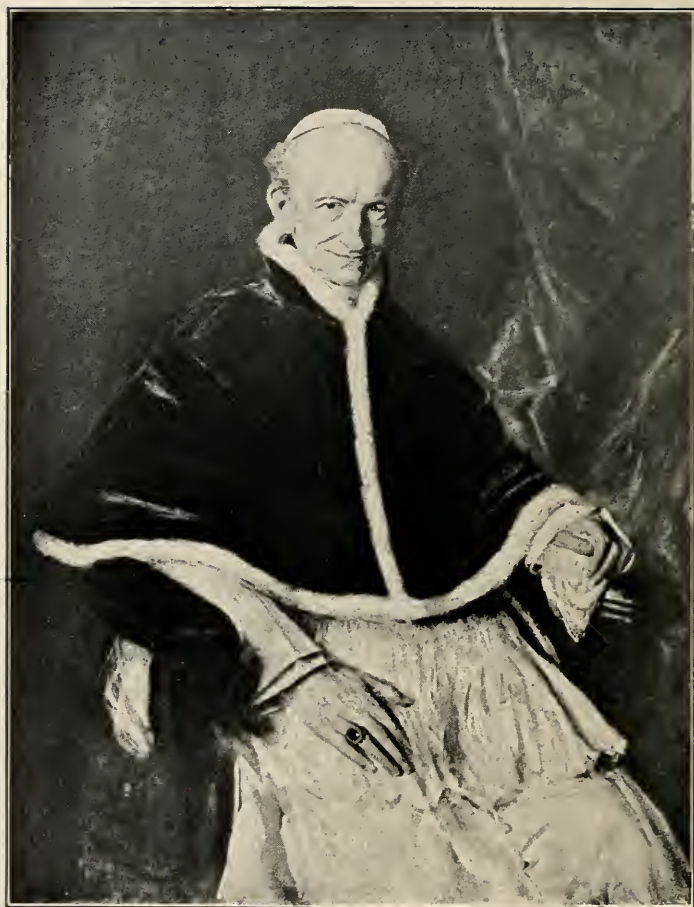
POPE LEO XIII