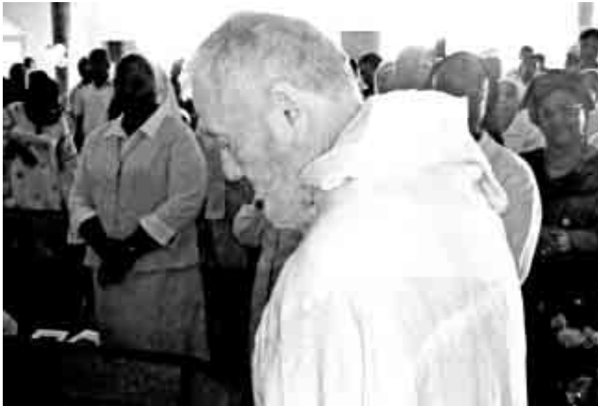
© Br Dismas Mary of the Cross