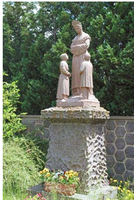
SHRINE AND CHURCH IN LA SALETTE FRANCE – FRENCH ALPS